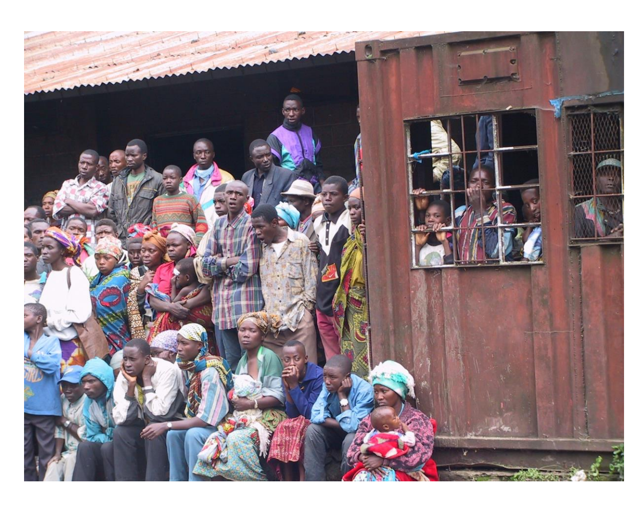
Page 3 sur 5