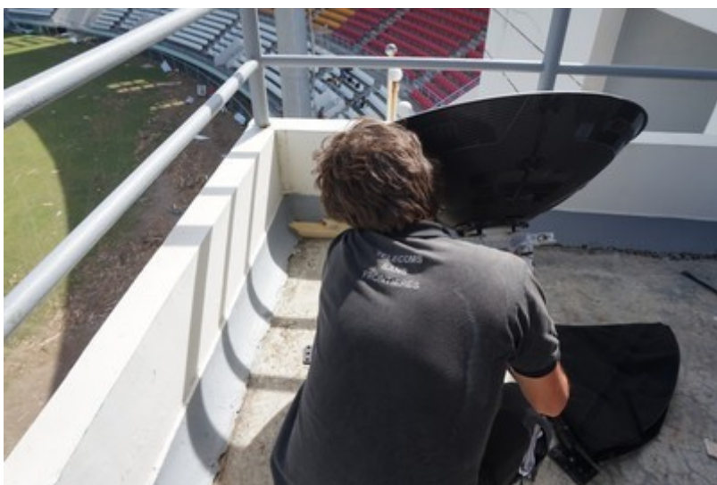
Windsor Park Stadium, Roseau – Global Xpress (GX) installation

A total of 86 GB of data have been transferred for logistics management, and information sharing.