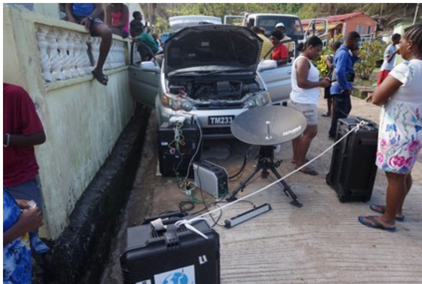
Thibaud Village – TSF providing Ambulant Wi-Fi Service

On the first day of operations, the team covered the villages of Vieille Case and Thibaud. TSF then went on to cover the town of La Plaine in the Saint-Patrick Parish, seeing a total of 272 unique devices connected to the Wi-Fi network.