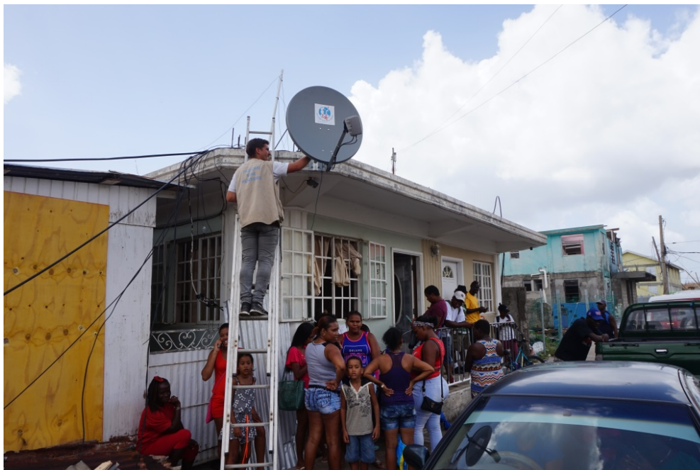
Portsmouth – TSF Internet hotspot

The affected communities also benefit from the connection so they can contact their relatives and organise the assistance they need. Discussions held on-site revealed that most of the people living on the island communicate using cross-platform communications apps such as Whatsapp and Messenger. TSF thus optimised its connectivity to ensure that messages via such platforms could still be exchanged, even in the event where several devices were connected to the network simultaneously.