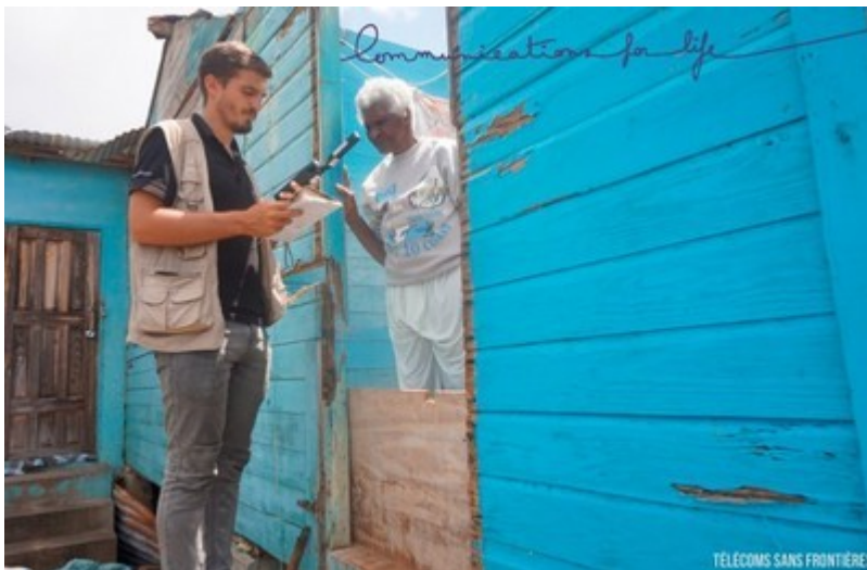
Saint-Andrews Parish - TSF Calling Operations

Télécoms Sans Frontières has been working to provide calls to families who have not had the chance to contact their relatives, reaching a total of 910 beneficiaries. These calls represent psychological relief and a bridge towards the world from which they have been cut off.