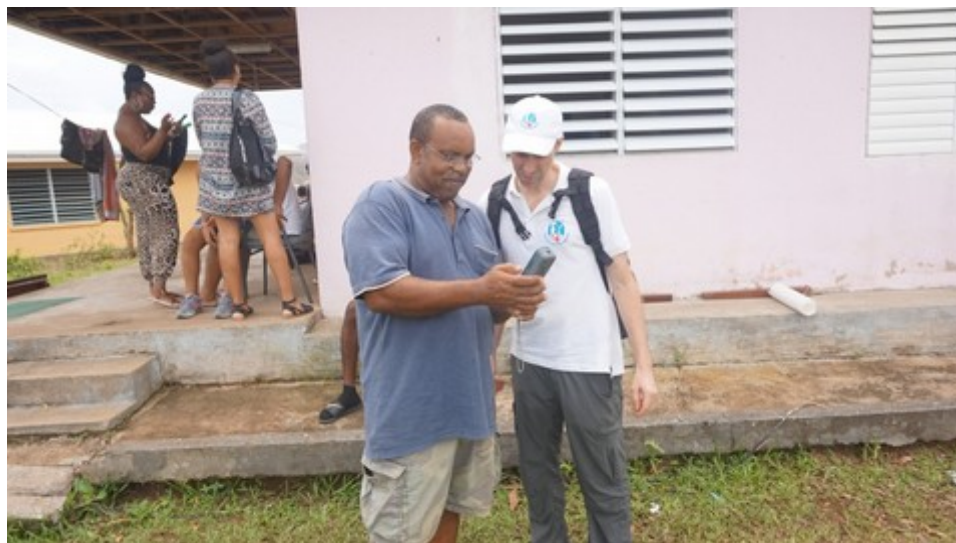
Wesley – Training for using a satphone

It is important for Télécoms Sans Frontières to support local actors by ensuring they have a number of different communication channels, whatever the situation. TSF has thus been supporting the towns of Wesley, Marigot, Salybia, La Plaine and Delices by making available satellite phones. This capacity, in addition to the Internet connection over satellite, is vital for communicating anytime, anywhere in case of emergency.